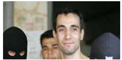
Save Farzad - pg.3 www.ie-ei.org/savefarzad