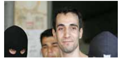
Save Farzad - pg.3 www.ie-ei.org/savefarzad

News from the General Union (Kansai & Tokai), NUGW Tokyo South, Fukuoka General Union